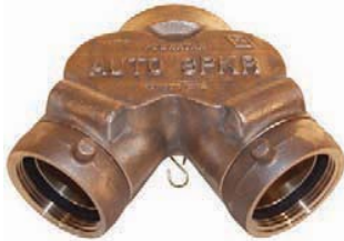
back outlet connection 21-132