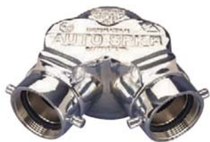
bottom outlet connection 21-133