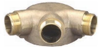
bottom outlet connection 26-297