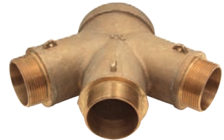
back outlet connection 26-295